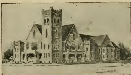
First Baptist Church Greensboro

RALEIGH PRESSES OF EDWARDS & BROUGHTON COMPANY. 1906